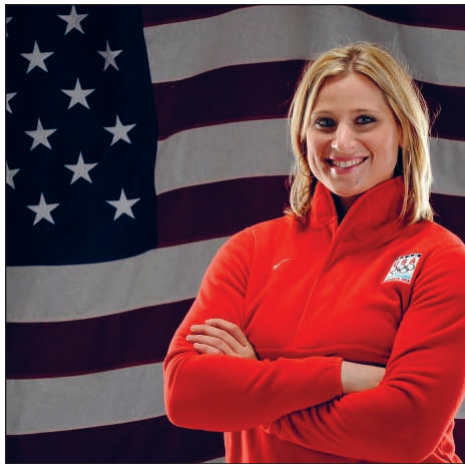
Angela Ruggiero Ice Hockey USA