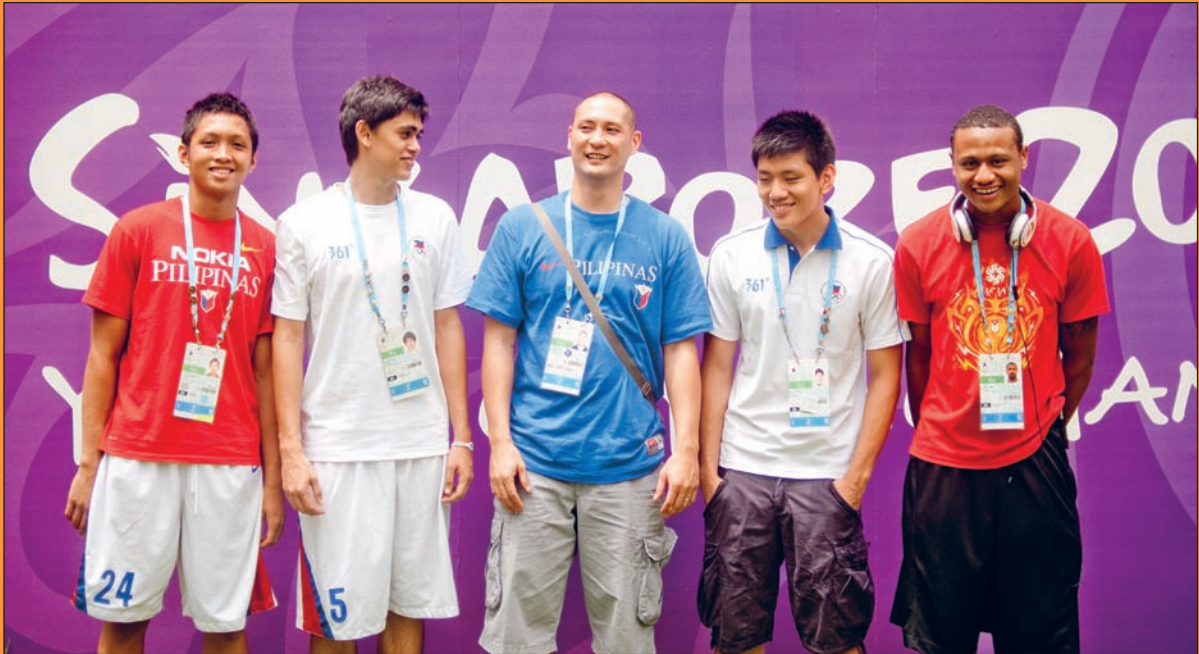
Meet the faces of the Philippines basketball team.

“To prepare for my race, I listen to dancehall music and visualise myself winning.”