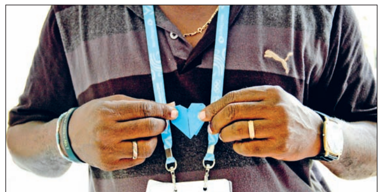
A participant showing his completed origami heart, representing respect.