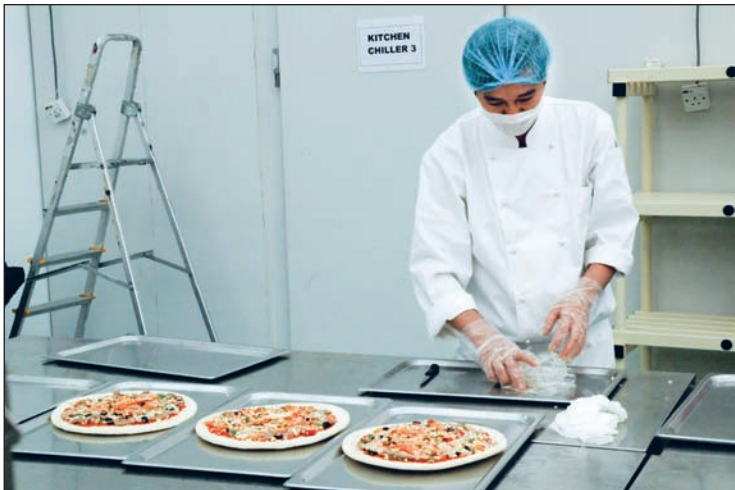
ABOVE: One of the kitchen chefs hard at work preparing a pizza for dinner at the Dining Hall. The kitchen churns out three pizzas per minute.