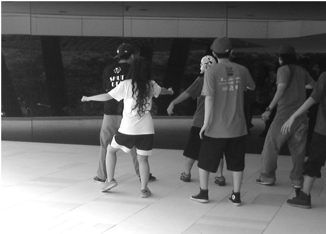
Image.2: Photograph of dancers on the Level 4 using the reflective glass.