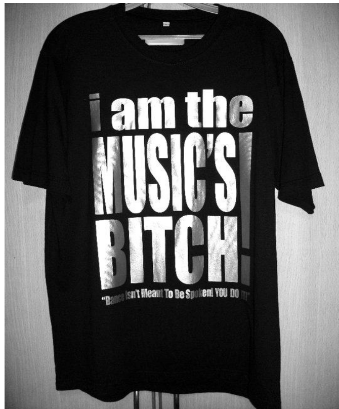
Image.3: "I am the Music's B*tch!" T-shirt designed by local dancer