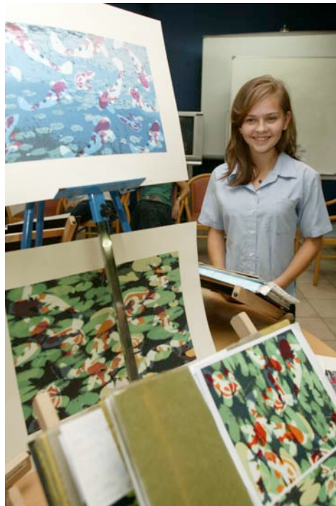
Tanglin Trust student in the exhibition