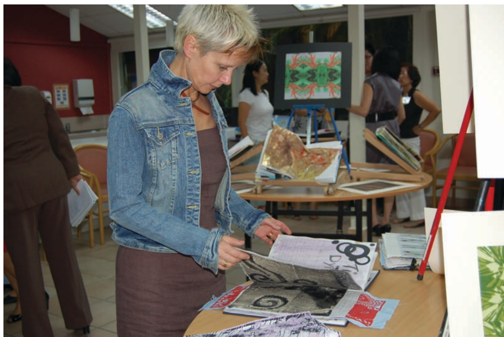
Exhibition of students' works, sketchbooks and process works were showcased to show the thought process of the project.