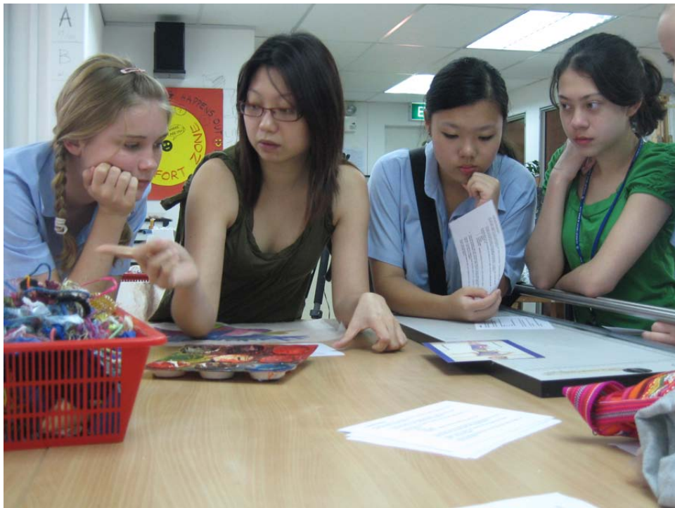
Working in the studio with the students