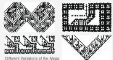
Different Variations of the Naga