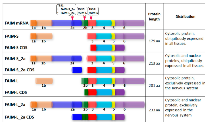
Figure 1. Structure and comparison of four human Fas apoptosis inhibitory molecule (FAIM) isoforms. Schematic representation of FAIM gene structure shown with exon 1a, 1b, 2a, 2b, 3, 4, 5 and 6. In contrast to the 5' and 3' untranslated regions (UTRs), coding sequence (CDS) regions are indicated with a darker color. TSS, Transcriptional start site.

More recently, Coccia et al. found two additional FAIM isoforms, FAIM-S_2a and FAIM-L_2a, which have the same sequence as FAIM-S and FAIM-L but include exon 2a. Similar to the expression patterns of FAIM-S and FAIM-L, FAIM-S_2a is ubiquitously expressed in all tissues, whereas FAIM-L_2a is exclusively expressed in the nervous system. Interestingly, in contrast to cytosolic proteins FAIM-S and FAIM-L, FAIM-S_2a and FAIM-L_2a are able to localize to the nucleus, indicating that these two FAIM isoforms may have additional neural-related functions (Figure 1). Importantly, FAIM-S_2a and FAIM-L_2a increased neurite outgrowth in NGF-treated PC12 cells, indicating their functional role in neuronal development and differentiation [7].