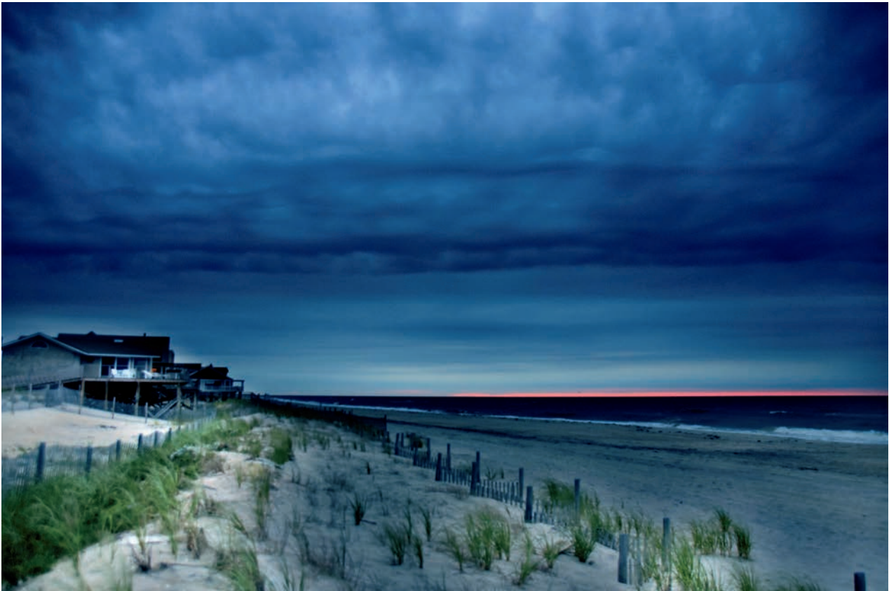
Dawn, Fire Island