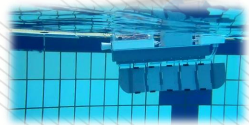
Underwater Robotic Knifefish