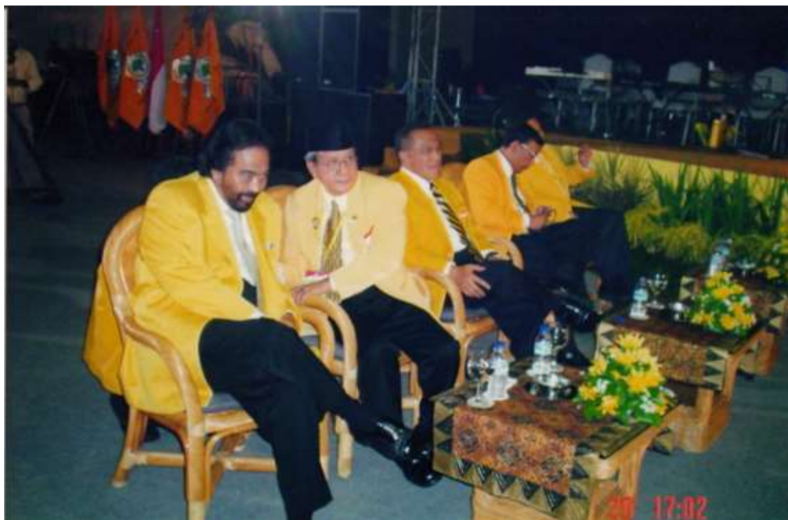
Left to right: Surya Paloh (now Nasdem), Akbar Tandjung, Aburizal Bakrie, Wiranto (now Hanura) and Prabowo (now Gerindra).