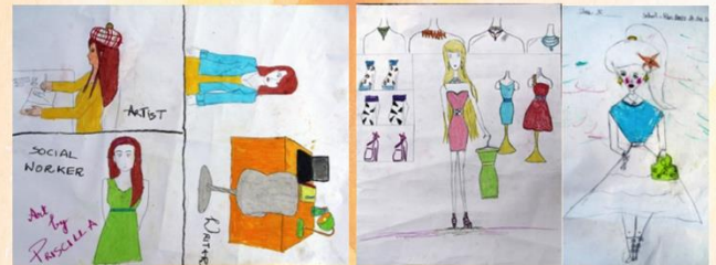
Self-portraits done by children in an orphanage at the city of Dimapur, 2013.