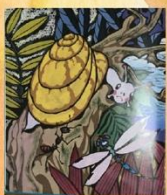
Why Snails Have Shells? (China)

As there are several neighboring countries border Nagaland (e.g. Burma, India, Tibet and even the minority cultures in China), it is thus important to refer to these cultures that possibly influence the aesthetics or the folktales of Nagaland. Case studies of illustrated books and their styles have been done and analyzed pertaining to this aspect, together with studies of illustrated books and their styles.