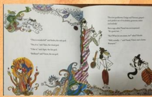
Hanuman's Ramayan (India)