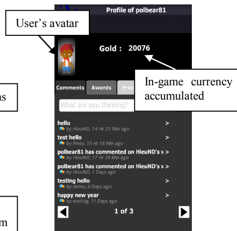
Fig. 4. A user profile with avatar and currency earned.

Acknowledgments. This work was supported by the Singapore National Research Foundation Interactive Digital Media R&D Program, under research Grant NRF NRF2008IDM-IDM004-012.