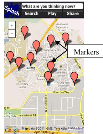
Fig. 2. Markers on the map indicate availability of virtual rooms.

In SPLASH, content sharing features are entwined with gaming features through virtual rooms where users interact, share content and play games. These rooms are designed to establish a sense of community among users, which has been demonstrated to foster content sharing [3]. Put differently, each place or unit is represented by a virtual room which in turn, provides a platform for accessing SPLASH’s content sharing and gaming features.