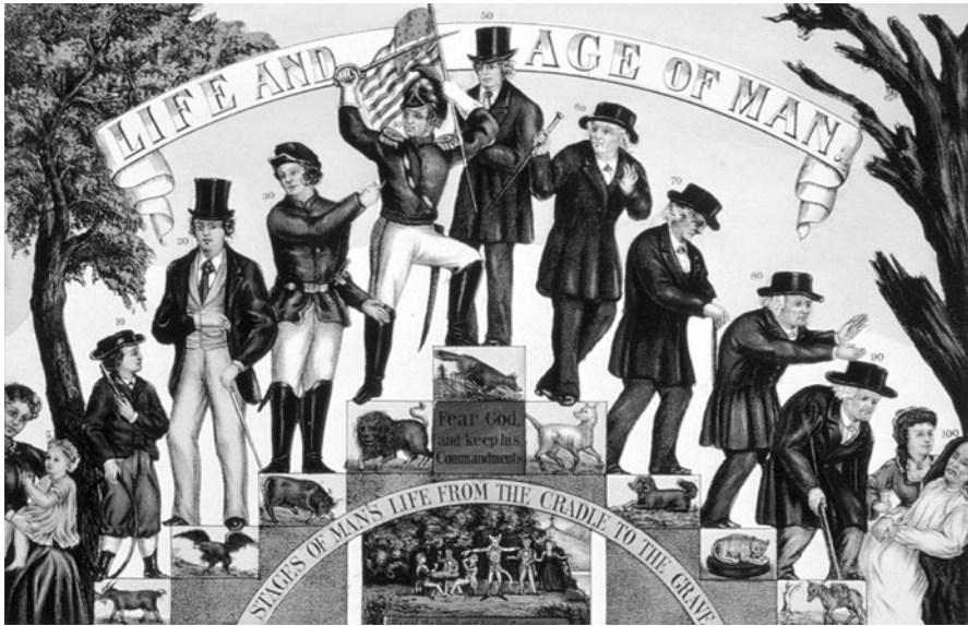
Figure 1. The Ascending and Descending Staircase Representing the Human Life. Currier and Ives, Life and Age of Man, Stages of Man's Life from the Cradle to the Grave. Created and Published between 1856 and 1907.