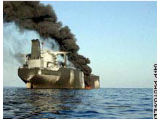
French Tanker Limburg attack killed one crew member & caused serious marine pollution on 6 October 2002