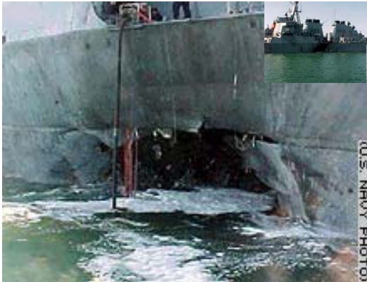
The USS Cole bombing killed 17 U.S. sailors on 12 October 2000