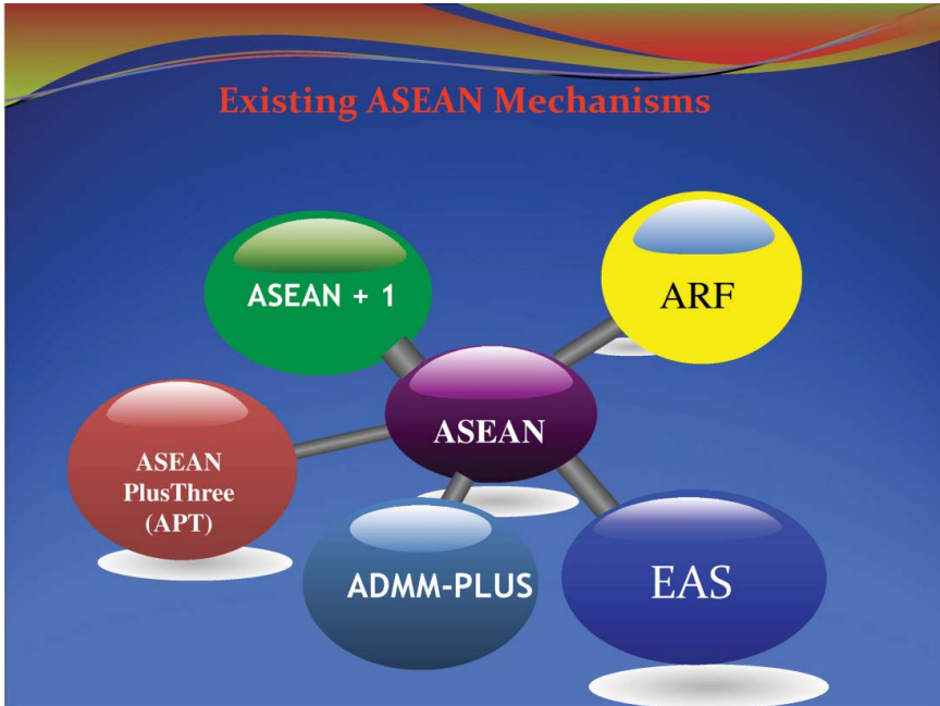
Figure 2 ASEAN and its mechanisms.