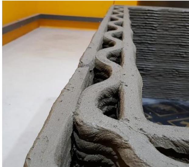
Figure 7. 3D printed lattice shape wall element printed in SC3DP, NTU.