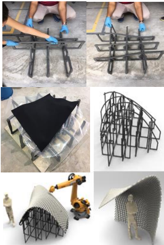
Figure 5. Curved bed printing with printed frames printed in SC3DP, NTU.