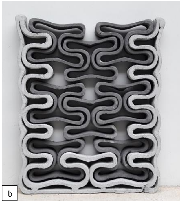
Figure 3. (a) Brick that provides passive cooling made by additive manufacturing (Fratello et al., 2015) (b) 3D printed modular wall printed in SC3DP, NTU.