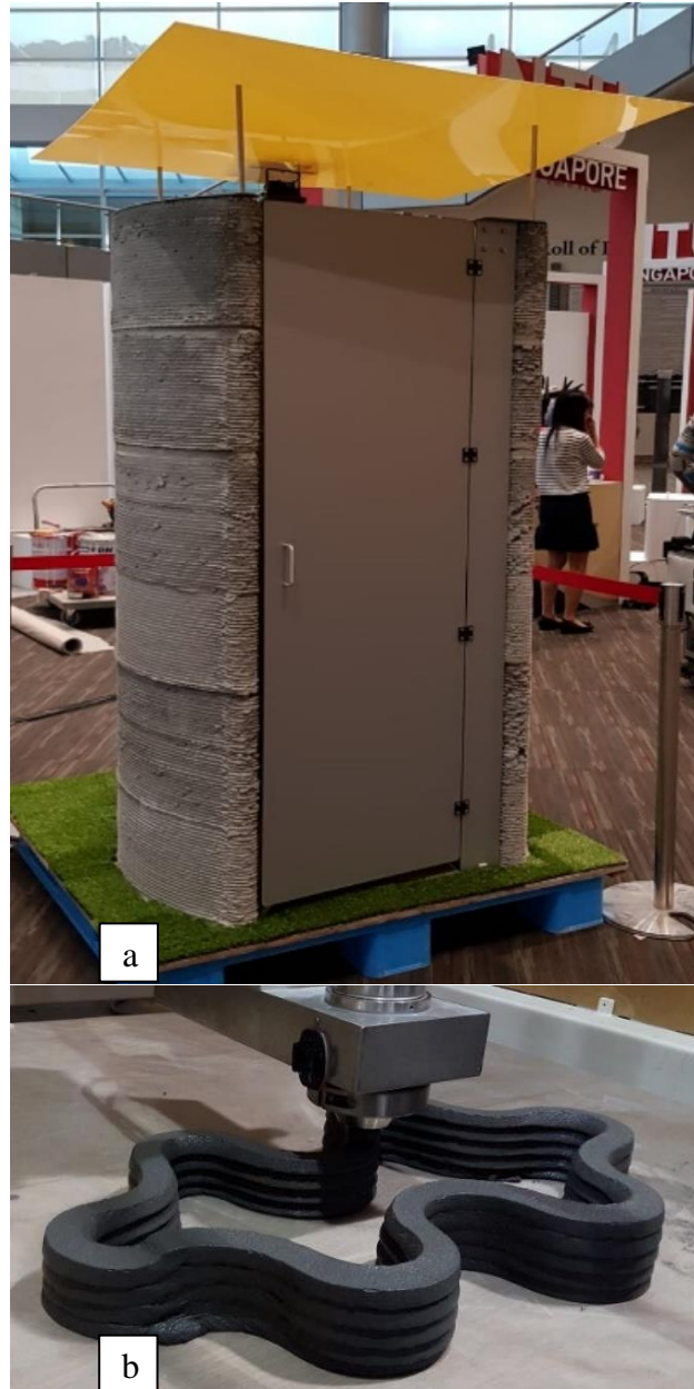
Figure 2. (a) 3D printing of modular toilet with high volume fly ash at SC3DP, NTU. (b) 3D printing of geopolymers.