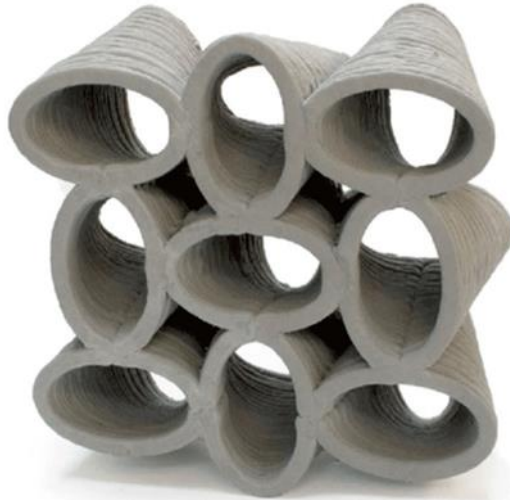
Figure 6. Concrete printed acoustic wall element (Valente et al. 2019).

Dampening the sound surrounding the building or within the premises can improve the comfort of the user. Using passive designs can reduce the need for additional material for soundproofing. Figure 6 shows an element that was designed to enhance the soundproofing capability of a wall (Gosselin et al. 2016). The generic elements were stacked together to form a complete wall. The geometries of the holes dampen the acoustic waves passing through.