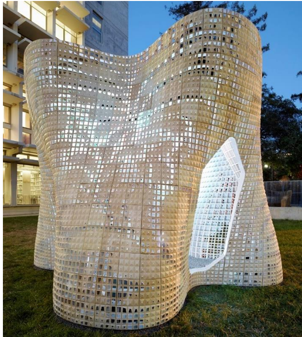
Figure 4. Structure printed in modular that have different light permeability (Stott 2015).