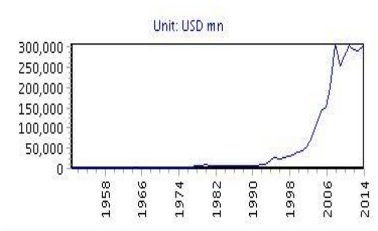
Figure 3.2: India's Foreign Exchange Reserve (annual, USD million) since 1951. 110

India's success in the high technology sector is also dramatic since 1991, as its exports have grown rapidly (see Figure 3.1). India's foreign exchange reserve crossed the $290 billion mark by March 2013 from a meagre $2161 million in 1951 (see Figure 3.2).