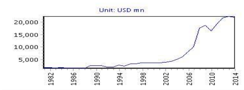
Figure 5.2: US Imports from India Since 1991 367