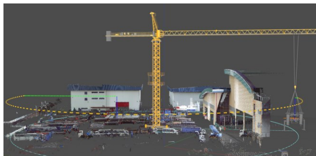
Figure 2: The generated lifting path.

One of the generated lifting paths is shown as Fig. 2. The target is first lifted up (dot line in blue) from the start location, trolley move out (dot line in green), swing (the circle in yellow), trolley move in (dot line in blue), lifted down (dot line in blue), and rotate the load (the fan area in orange), and reach the end location.