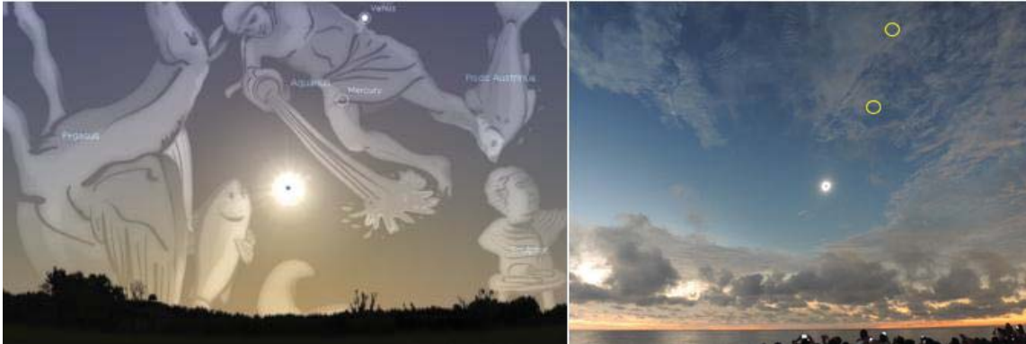
Figure 3. (Left panel) Sky simulation at the moment of total phase at Terentang beach using Stellarium software. (Right panel) Identification of planet Venus and Mercury (yellow circle) in digital image obtained using pocket digital camera NIKON Coolpix P520 f/3.1, 1/8 second, ISO 450 during total phase.

With a smaller magnitude than the unaided eye magnitude threshold, Venus was easy to be observed during the total phase. On the other hand, it was difficult to observe Mercury at the time, since it had a magnitude which was fainter than magnitude threshold, namely 0.46. To ensure that the observed was Venus, the team members compared the digital image obtained on the resulting simulation software Stellarium ( www.stellarium.org ) as shown in figure 3.